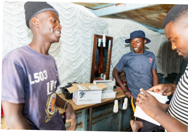
SRHR Tuck-shops Launch