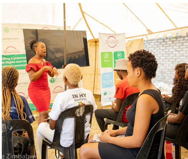
GirlsChose champion training