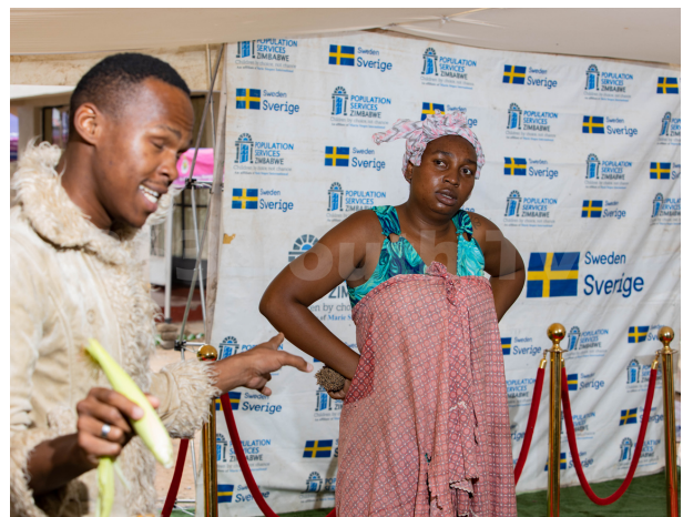
Theatre for Development