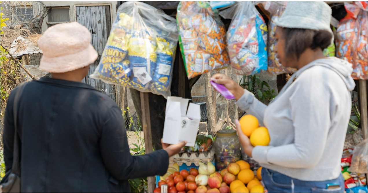
SRHR Tuck-shops Launch