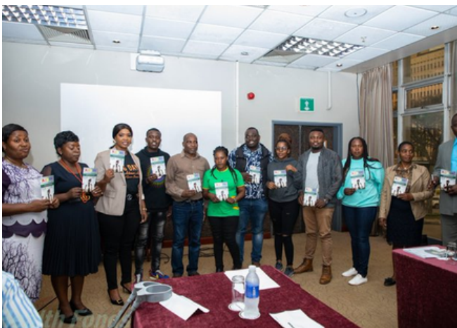
Launch of the A guide to your rights and law handbook